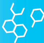
Carbon Block Filter