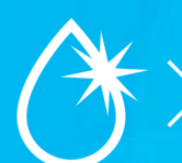
Granular Activated Carbon Filter