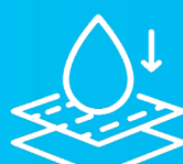
Reverse Osmosis Membrane